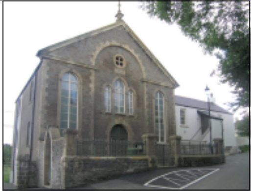
Groeswen Chapel, Caerphilly

A contract for repair of the Vestry and the external fabric of the Chapel was completed in June this year by Tract Construction of Cardiff. The works have included the replacement of both roofs with Penrhyn Welsh slate. Failed plastic rainwater gutters have been replaced with cast iron replica fittings.