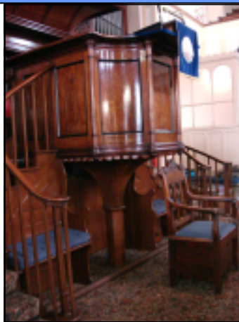
The wine glass pulpit at Heol Awst