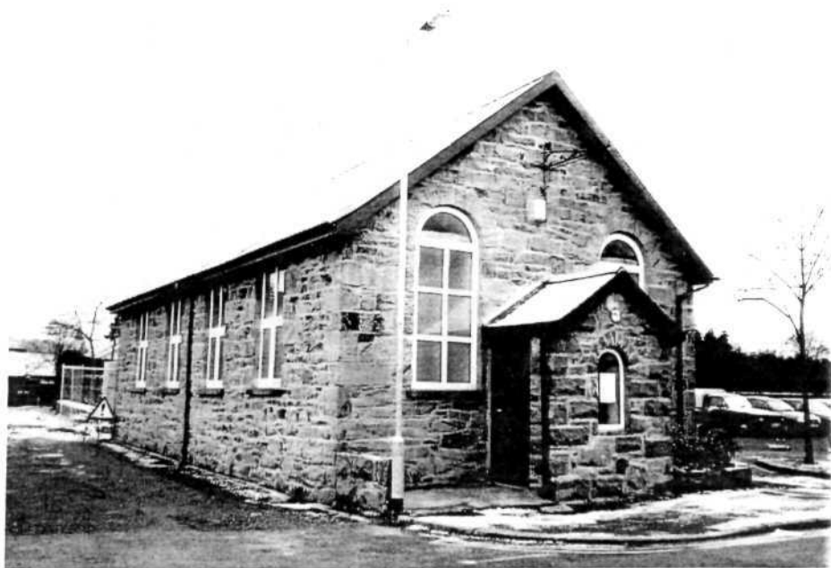
Y Capel Bach / Plase St Chapel

About the year 1880 an influx of English labourers arrived in the area to build the railway line to Blaenau Ffestiniog. There was no place for the non-conformists among them to worship and it is said that this was one reason for building a small chapel in Plase St. Rumour has it that the G.W.R. contributed to the building costs. Plase was more than a street; it was a community, poor, industrious, with the houses given to flooding on a regular basis. The chapel was run by Capel Tegid and many who attended regularly would never attend Capel Tegid itself. The town still enjoys relating the stories of Capel Bach, its Sunday School and its football teams. The lease of the land reverted to the County Council in 1980, when the population had been shifted to the newer council houses. In 1992 it took on a new role as the home of the Bala and Penllyn Heritage Society.