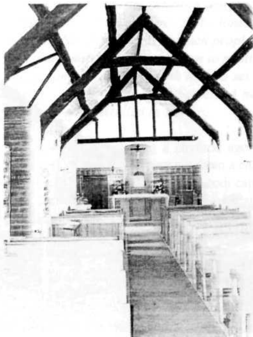
Eglwys Fatima / Church of Our Lady of Fatima