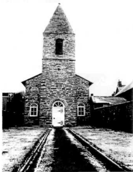
Y Capel Saesneg / The English Chapel

Wedi cyfnod o fod yn Ysgol Eglwys hyd nes y codwyd adeilad mwy pwrpasol i hynny ym 1870, daeth yr hen gapel anwes yn rhan o'r Ysgol Fwrdd a oedd wedi ei sefydlu yn yr adeilad cyfagos. Codwyd Ysgol Gynradd Sirol newydd ym 1904, ac fe brynwyd yr hen gapel anwes gan Dr Roger Hughes a'i gyflwyno ym 1907 i Gapel Tegid, lle yr oedd yn flaenor fel y gellid cynnal gwasanaethau Saesneg yno. Yr oedd hyn yn gallu darparu ar gyfer yr ychydig bobl di-Gymraeg yn y dref ond yn bwysicach yn rhoi cyfle i fyfyrwyr Coleg y Bala i gael ymarfer pregethu yn Saesneg. Agorwyd ei ddrysau fel Capel Saesneg ym 1907 ond cangen o Gapel Tegid dan ofal Stiwardiaid ydyw hyd y dydd hyn.