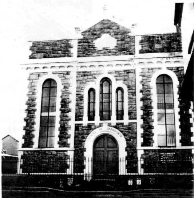
Capel yr Annibynwyr / Congregationalist Church