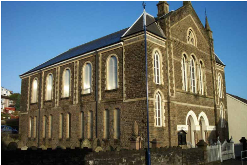
Capel Annibynol Hebron, Clydach

Credir i achos Annibynol Hebron, Clydach, gael ei sefydlu ym 1809 dan adain Eglwys Mynyddbach - ond efallai daeth i fodolaeth mor gynnar a 1804. Yn y cyfnod cynharaf, cynhelid y cyrddau mewn tŷ o'r enw Pentremalwed ger Gamlas Abertawe ond ym 1821 codwyd capel at y pwrpas ar safle gyfagos. Oherwydd twf yr aelodaeth, aethpwyd ati ym 1848 i agor capel mwy o faint wrth ochr y brif ffordd i Abertawe, eto ond tafliad carreg o'r gamlas. Yn dilyn cynnydd pellach, codwyd capel newydd sbon ar yr un safle ym 1884 a dyna lle cynhaliwyd oedfaon a holl gyfarfodydd eraill Hebron hyd at y datgorffori ar Fawrth 12fed, 2008. Ym 1892, gadawodd grwp go sylweddol o aelodau i ddechrau achos newydd Carmel, Clydach - ac adeilad Carmel fydd lleoliad yr eglwys