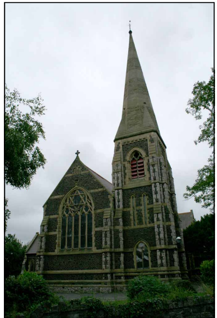
St. John's, Colwyn Bay

experience of chapel conversions and grant applications he was able to give us a great deal of information about the planning process and the associated regulations which govern the activities of local authorities. The comments and questions which followed his talk showed members' lively interest in the topic.