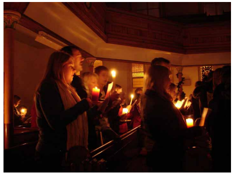
Yr oedfa Blygain olaf yn Hebron, Dydd Nadolig 2007

This is an article on the creation of a new united church in Clydach, Swansea following the closure and unification of three chapels: Salem Presbyterian Church, Hebron Independent Chapel and Carmel Independent Chapel.